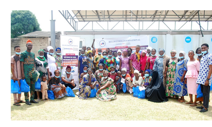
Youth Empowerment Workshop for 154 youth who learned a series of vocational skills including shoe repair, bead making, hair cutting, soap, textile, and baking.

Bellwether sponsored a conference for girls teaching on the importance of female health which was attended by 220 women who learned to sew their own menstrual pads in addition to receiving menstrual pad and resource materials.